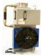
HC13 Cooler Dimensions Weight: 35kg